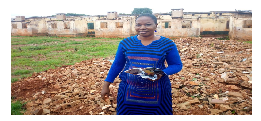
Figure 3: A photography of a dilapidated classroom.

2. The photography of dilapidated building behind the instructor below was supposed to be a classroom. No student or instructor will be comfortable to stay in such building for learning. Learning is all about having a good comfort and as well as being happy. Sequeira (2012) states that you cannot motivate others if you are not self-motivated; and learning is both motives (motives are not seen) and behaviour but only behaviour is seen, learning is internal, performance is external.