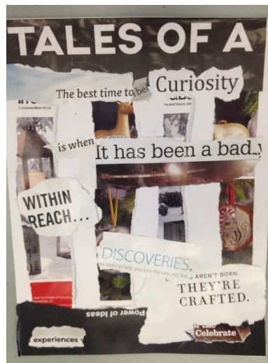
Figure 2. Example of visual collage.

The researchers then encouraged participants to discuss the elements of their collage that were most sacred to them as practitioners, as well as their thoughts about what elements of their own praxis they see reflected in or excluded from the dominant discourses surrounding identity in Child in Youth Care. Through discussion, the cohort developed a loose definition of a CYC identity archetype and actively compared their expressions of praxis with that construct. The session concluded with an open discussion regarding participants' collages, the process of collage creation, and the reciprocal impact of professional identity on praxis.