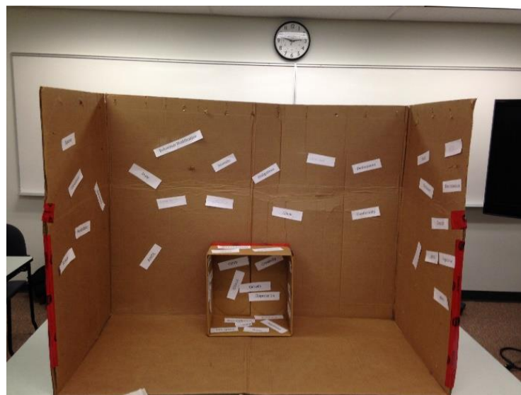
Figure 1. Boxes.

The selected words represented common terminology, concepts, values, and beliefs that the researchers felt represented a CYC identity archetype and CYC praxis. Participants were given blank slips of paper with which to contribute additional words that, for them, represented CYC. Research Cohort A was then instructed to decide as a group which words most and least represented a CYC identity archetype by placing the words in two boxes labelled “praxis” and “CYC Identity.” These boxes (see Figure 1) symbolized what language is common or promoted within a CYC context and which words are not, and thereby defining roles, rules, and expectations for workers within a CYC archetype.