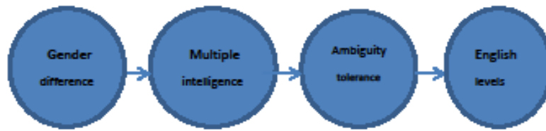
Figure 2. Gender, Multiple intelligence, SLTA and English