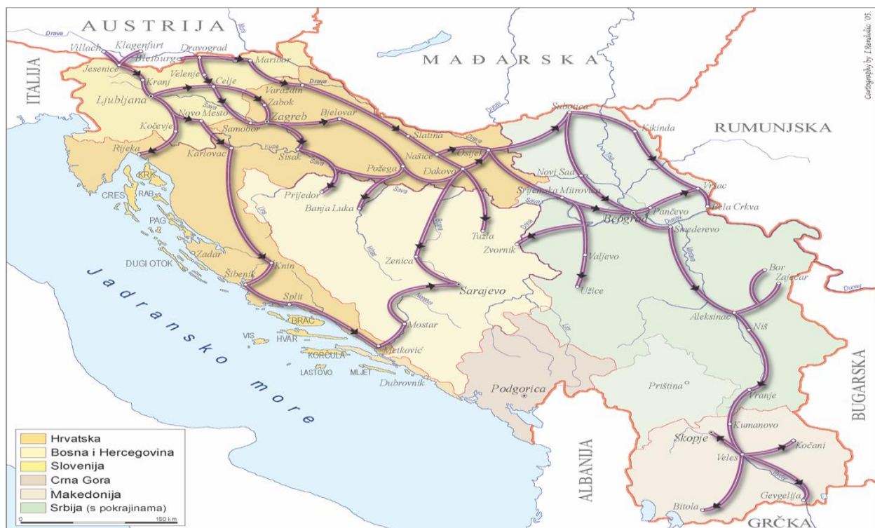
Figure 3: Death Marches - An Overview of Main Routes of the Croatian Way of the Cross

The majority of the refugees who were turned over to Tito were killed under conditions of indiscriminate savagery in Tito's notorious death marches and massacres. Throughout their journey the prisoners were beaten, tortured and killed, individually and in groups (Geiger 2013, pp. 77-80). These death marches frequently covered hundreds of miles and extended for many months' duration. Figure 3 identifies the routes of the death marches that have come to be known as the Croatian Way of the Cross (Ferenc and Kuzatko 2007, p. 36).