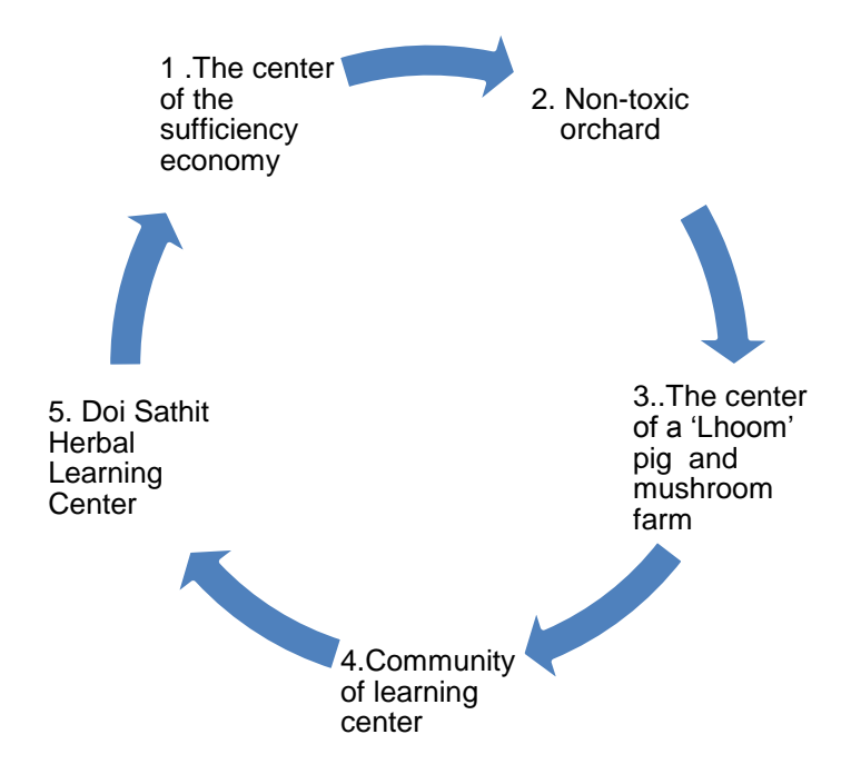
Figure 3: Route of attraction at Klong-Blab village

The route of attaction at Klong-Blab village are 5 areas, The first is center of the sufficiency economy, The second is Non-toxic orchard, The third is center of a 'Lhoom' pig and mushroom farm, The forth is Community of learning center and Doi Sathit Herbal Learning Center is the last attraction. In conclusion, these 5 areas were then a single local tourist attractions, now they become Klong-Blab community tourist attraction.