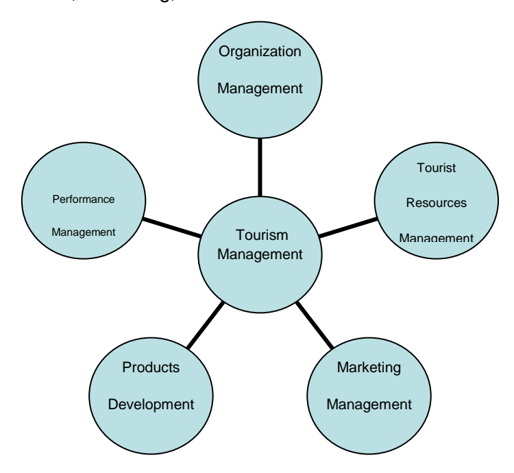
Figure 2 : Tourism Administrative Management Framework

assessment criteria, highlighting the benefits the community. Valuable natural and cultural, Educational and developmental programs, strengthening features. Ego appearance of the community and area, Regardless of their capacity to absorb resources, preservation of natural and cultural heritage resources, marketing, sustainable tourism.